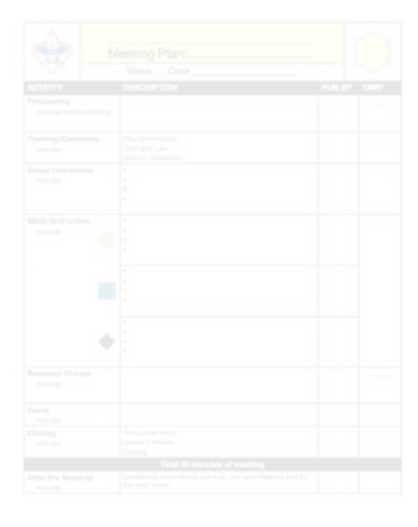
Click above for fillable troop meeting planning form.